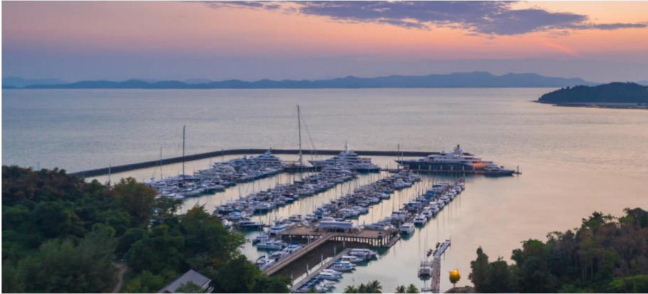
Ao Por Grand Marina