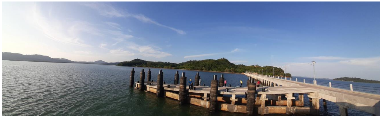
Pier near the land Site