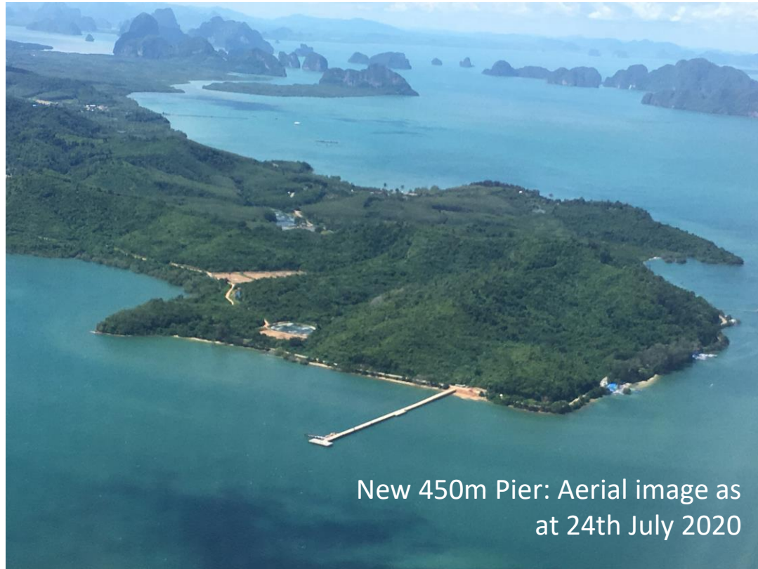
New 450m Pier: Aerial image as at 24th July 2020

https://drive.google.com/drive/folders/1mcww2XCyXaCVxla6ePgp0ebip_IHitDz?usp=sharing