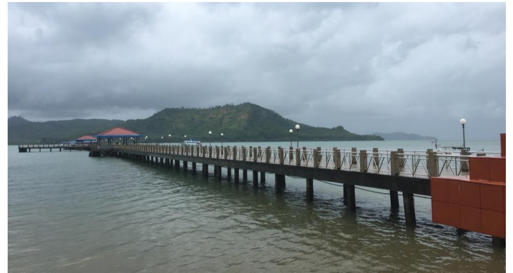
Laem Sai Pier